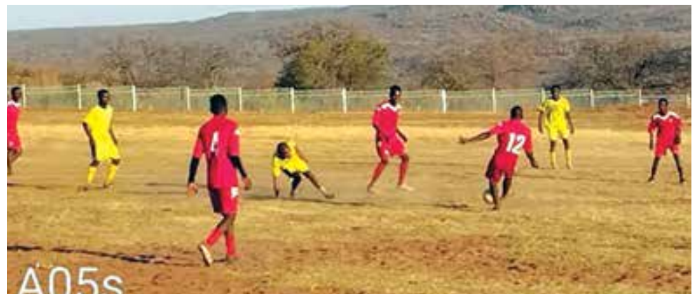
Ratanang FC (Wearing red soccer jersey) in action with Rocks FC at Rocks Sports Grounds in Makgatle Village.