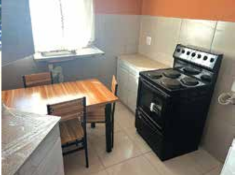
RDP standard newly built fully furnished houses which were given to the impoverished families from Makgata family in Waalkraal and Moepya family in Kgobokwane Villages.